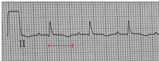
Figure 2) An electrocardiogram displaying a prolonged QT interval (arrow) secondary to hypocalcemia in a severe hydrofluoric acid burn

Immediate skin surface irrigation with tap water should be initiated to remove HF from the skin and prevent rapid penetration by the extremely lipophilic acid. There is general consensus that lavage should occur immediately at the site of the accident for 15 min to 30 min before proceeding to the emergency department. "HF chemical injuries in which lavage was initiated as a first aid measure showed significantly less full-thickness injury and more than a twofold shorter hospital stay compared to those who did not receive lavage until admission to hospital" (2,16). No fluid decontamination alternatives have been shown to be superior to water for first-aid irrigation (17).